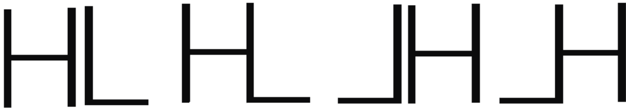
HL Straight Away

Brands are read left to right, or top to bottom.